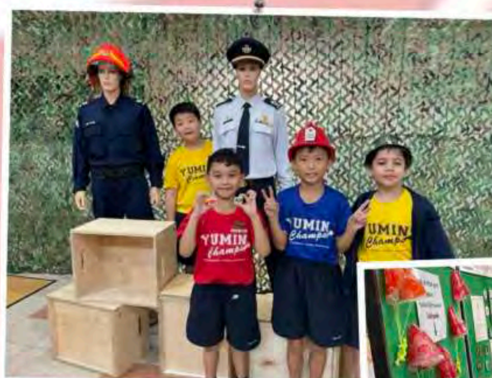
◀ Our Yumin Champions checking out the uniforms and equipment from the respective military groups!