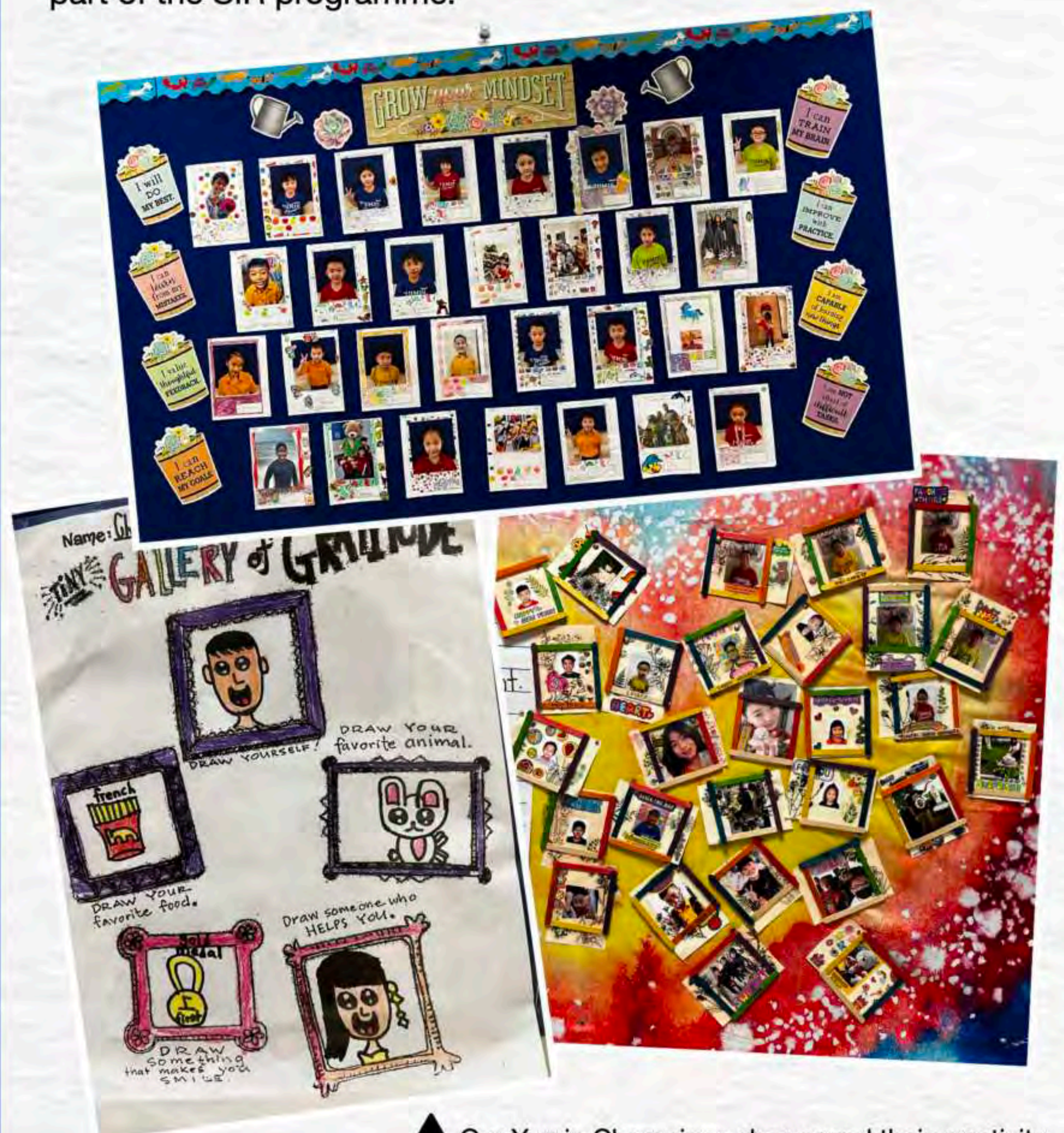
▲ Our Yumin Champions showcased their creativity in the various SIR activities such as "Tiny Gallery of Gratitude", "Design Your Own Polaroid" and "Create Your Own Photo Frame".

It was an awesome time for our Yumin Champions to catch up with their friends, and even make some new ones in their new classes! They also got to meet and interact with their form teachers through the variety of activities that were conducted as part of the SIR programme!