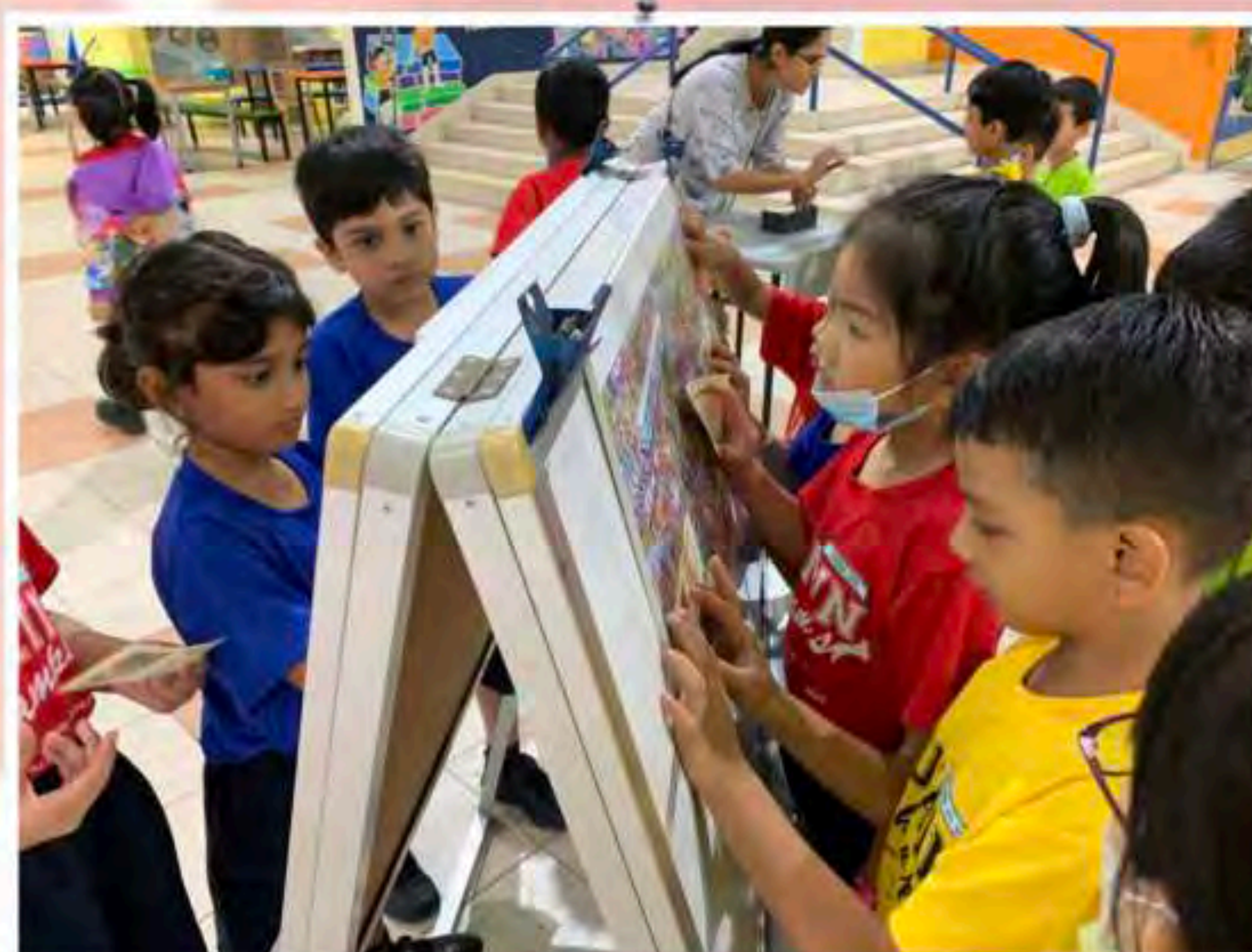
◀ With more than 50 acts of Total Defence hidden in the puzzle, looking for them was no mean feat!