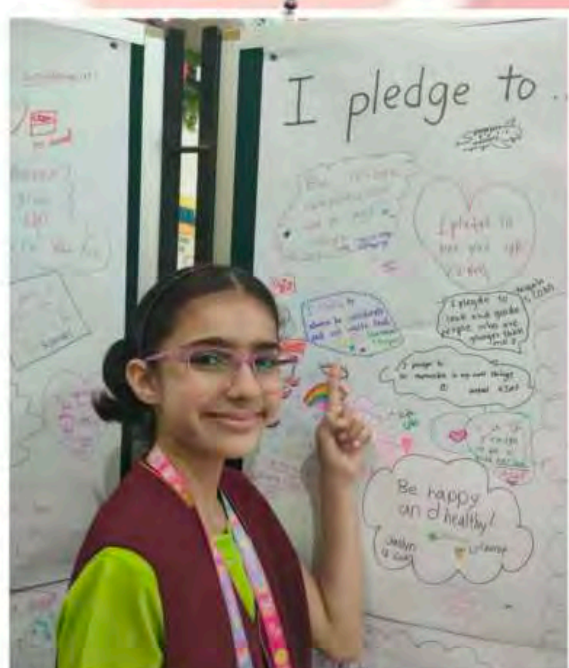
▲ Students writing down their pledges for Total Defence.