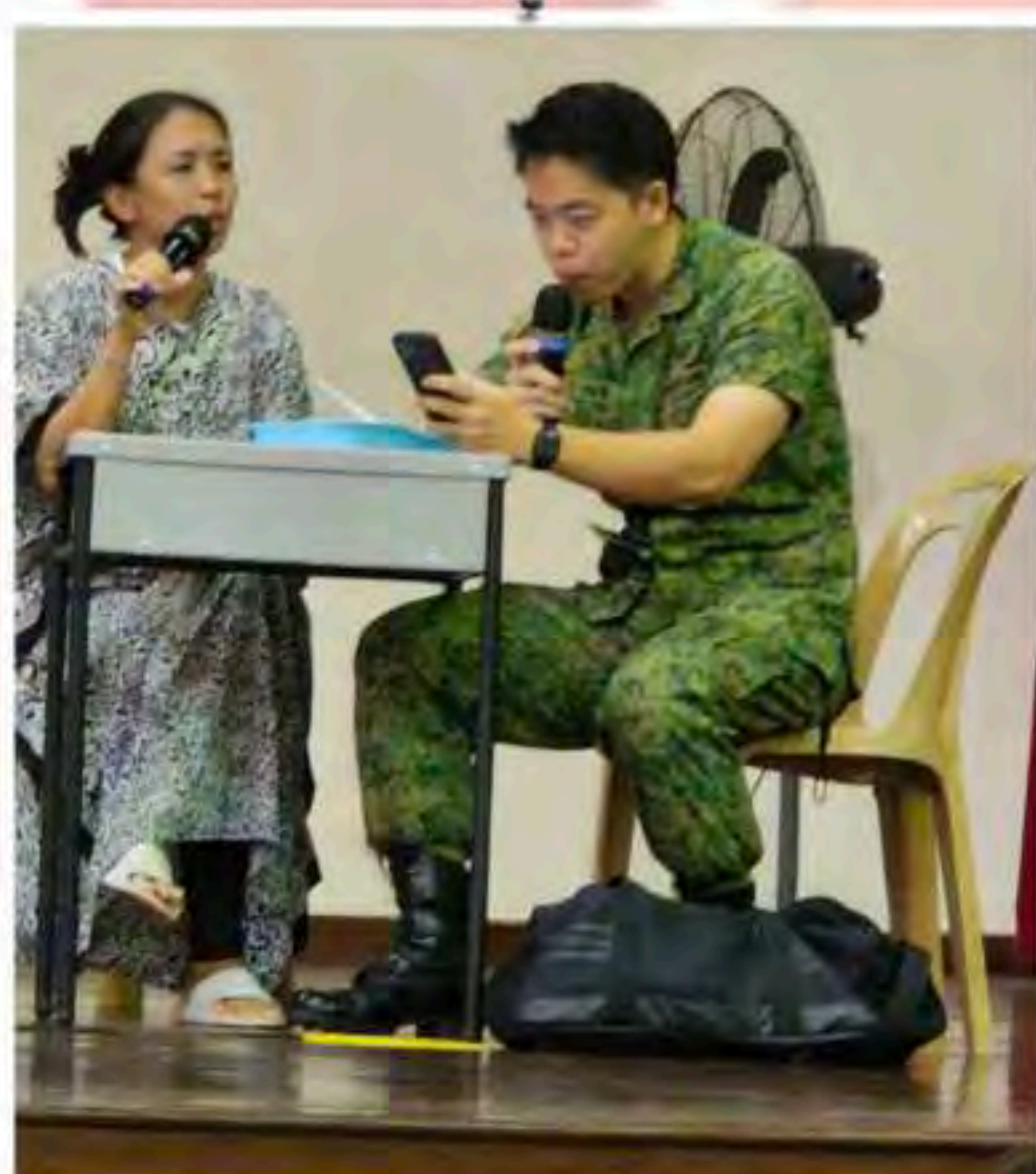
▲ The skit helped to drive home the message of safeguarding ourselves against fake news.

At Yumin Primary, we commemorated TDD with a slew of activities that serve to drive the message that every Singaporean, young or old, has a part to play in our daily lives to ensure that Singapore is prepared for crises and disruptions, and that we remain resilient and united as one people.