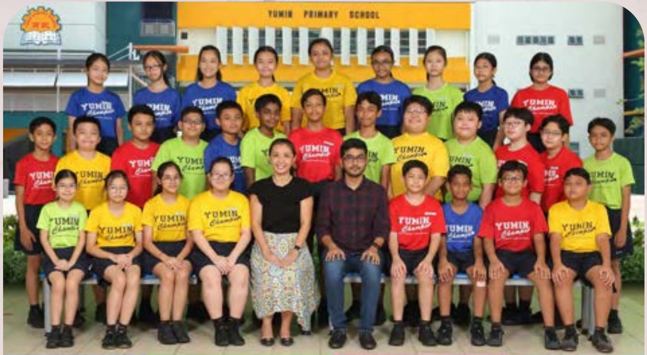
YUMIN PRIMARY SCHOOL