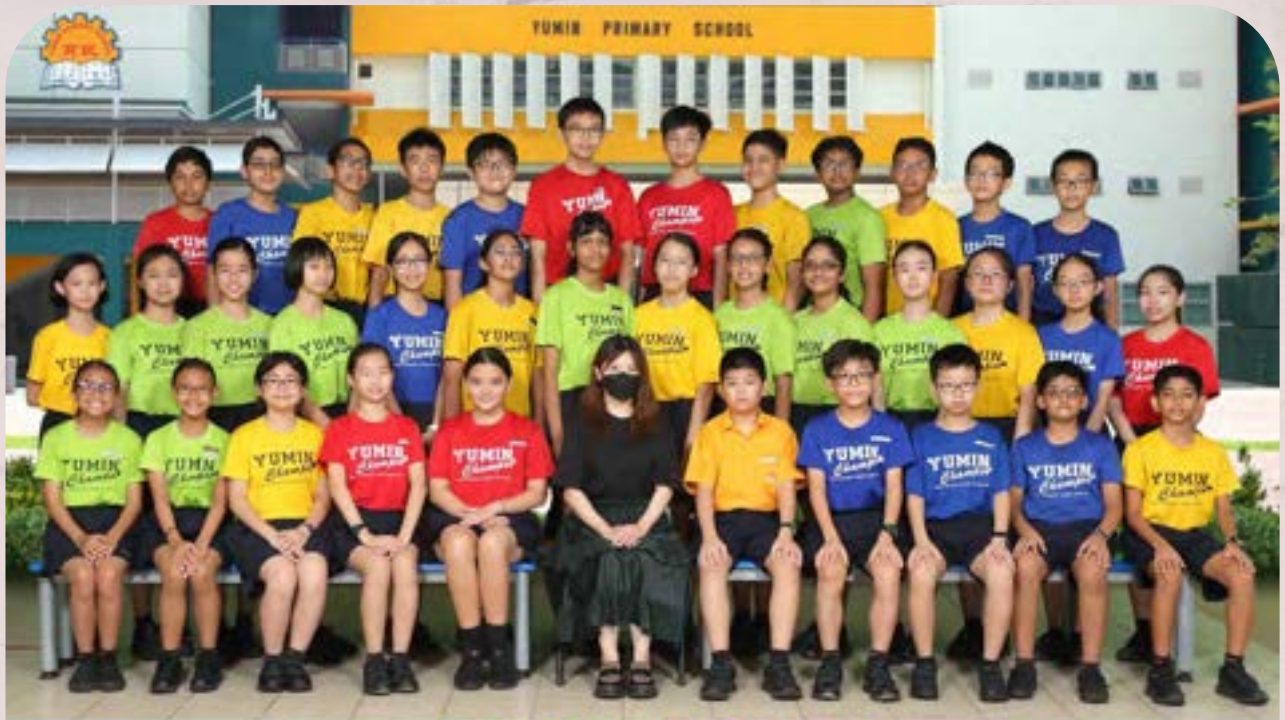
YUMIN PRIMARY SCHOOL